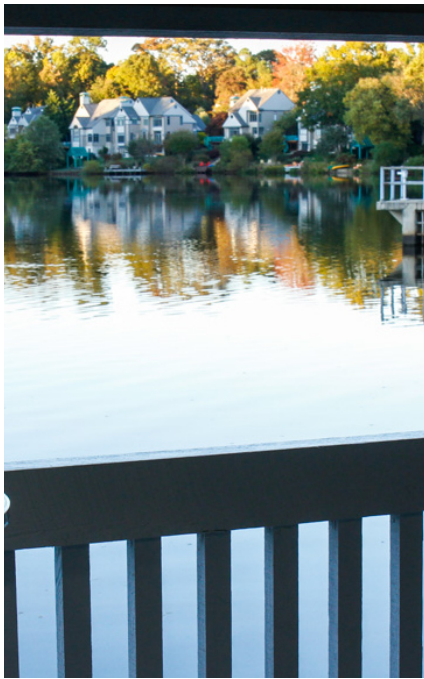
We couldn't have asked for a more beautiful fall day! The lake provided the perfect backdrop for the evening's festivities.