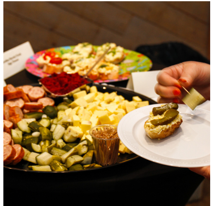
During cocktail hour, guests enjoyed light bites like klobasa, homemade hručka, and obložené chlebičky.