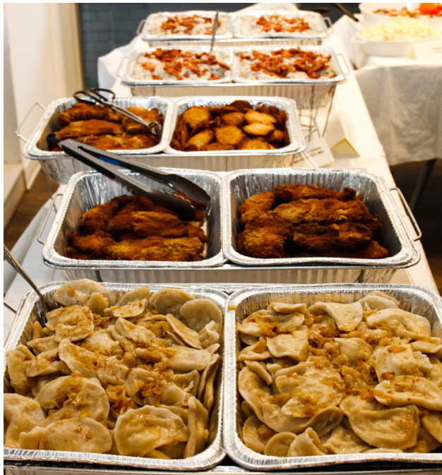
Pirohy and rezeň and halušky, oh my! Leftovers didn't last long—guests were encouraged to take extra food home to keep the party going.